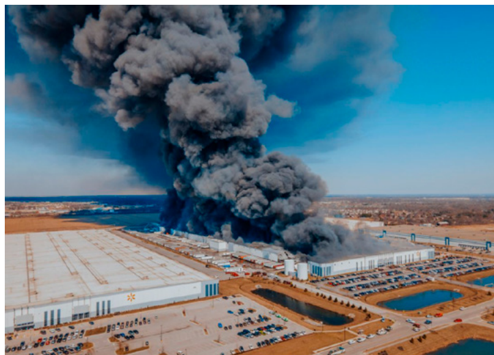
Scene from the March 15, 2022 fire at the 1.2-million square-foot Walmart Distribution Warehouse in Plainfield, Indiana

Fire is fast. Fire sprinklers are faster.